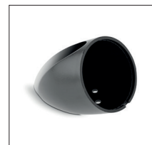
Tilted mounting frame: Easy to install